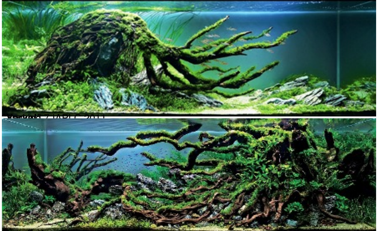
VALGE DUE INUTSATIONGAGAGPERUILI AND TATO